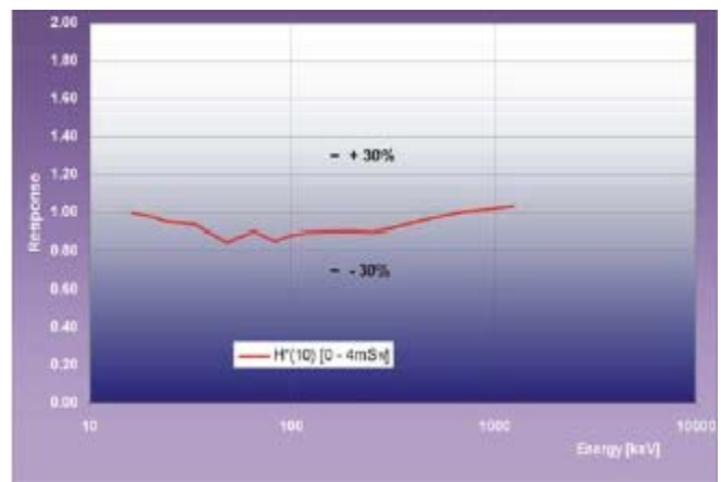
Typical energy response of ambient dose equivalent H^*(10) of more sensitivity element

* When calibrated after every 10 Sv of accumulated dose