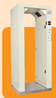
GEM™-5 Gamma Exit Monitor