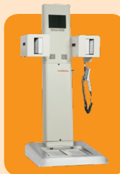
Sirius™-5 Hand, Cuff & Foot Monitor with optional Frisker shown