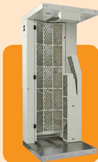
Argos™ TPS Family of Gasless Whole Body Monitor

>> CANBERRA's contamination monitor support and service contracts are designed to help you get the most from your Argos, GEM-5, Cronos, Sirius, and even non-CANBERRA monitors.