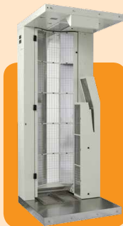
Argos™ AB Gas-Flow Whole Body Contamination Monitor