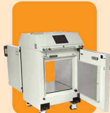
Cronos Gamma Object/Tool Monitor

CANBERRA offers a range of contract options to suit the unique support requirements of your site or fleet. Whether your goal is to maximize the performance of your CANBERRA monitors, or to verify/assess the performance of your entire contamination monitoring program, our team of professionals (Certified Health Physicists, Engineers, technical and application support experts) is available to work with you.